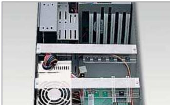
Two Adjustable Card Retainer Positions For fixing all the cards more flexibly and tightly