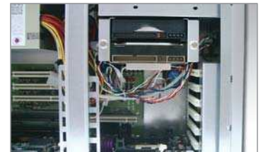
New HDD Drive Design Easy to install HDD drives