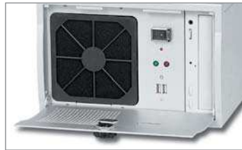
Plastic Fan Filter For easy cleaning and replace