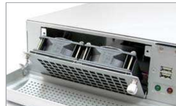
Front Replaceable Air Filters/Fans

Convenient to change air filters or fans when needed