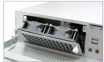
Front Replaceable Air Filters/Fans Convenient to change air filters or fans when needed