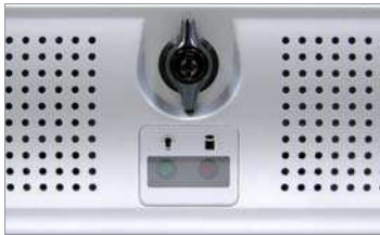
Thumb Lock Convenient to operate or protect the system