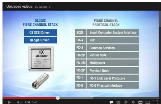
QLogic Adapter of Choice for Fibre Channel SAN

Click in the video links to see why QLogic adapters are the best choice for your storage area network.