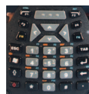
Numeric only (S model)