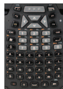
Full alphanumeric ABCDEF (C model)