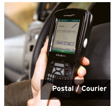
Postal / Courier