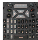
Full alphanumeric Qwerty (S model)