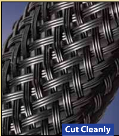
Cut Cleanly Hot Knife