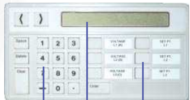
Numeric Keypad for Data Entry