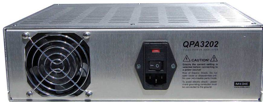
Figure 2: User interface of the QPA3202

All controls and signal terminations of the QPA3202 are on the face of the instrument as illustrated in Figure 1. The AC power cord receptacle and fuse are on the rear panel Figure 2. At the left are three multi-colored LED indicators that alert the user to the instrument status. When the power switch is closed and the amplifier is on, the green LED marked PWR will be illuminated. The output of the amplifier requires a Conxall connector, however the input and monitor connections are made using a BNC connector.