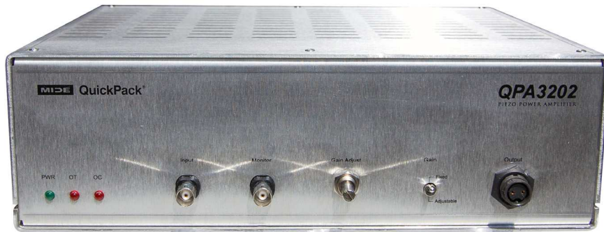
Figure 1: User interface of the QPA3202

All controls and signal terminations of the QPA3202 are on the face of the instrument as illustrated in Figure 1. The AC power cord receptacle and fuse are on the rear panel Figure 2. At the left are three multi-colored LED indicators that alert the user to the instrument status. When the power switch is closed and the amplifier is on, the green LED marked PWR will be illuminated. The output of the amplifier requires a Conxall connector, however the input and monitor connections are made using a BNC connector.