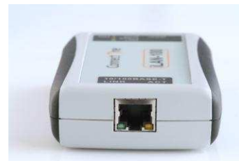
RJ-45 Connector Link and Activity LEDs