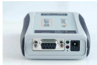
Serial Connector, Power Jack, Mode Select, SerialNET and Power LEDs