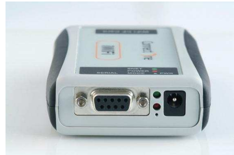
Side view: serial connector, power jack, mode select, SerialNET and power LEDs