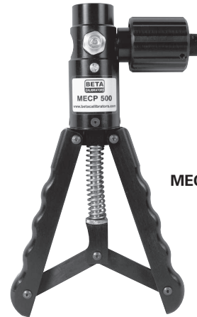
MECP-500 Hand Pump