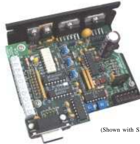
(Shown with SIN-20 Adapter)