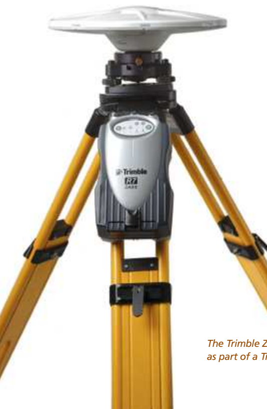
The Trimble Zephyr Geodetic 2 antenna is shown as part of a Trimble R7 GNSS base station.

The Trimble Zephyr 2 and Zephyr Geodetic 2 antennas offer full support for coming and near-future GNSS signals, including GPS L2C and L5, GLONASS, and even Galileo. This technology future-proofing, in combination with the rugged durability of each antenna, means any investment in a Trimble Zephyr GNSS antenna will last for many years.