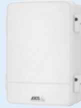
AXIS T98A-VE Surveillance Cabinet Series