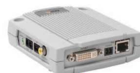
Simple monitoring solution for Axis network products.

In situations where only live video display is required – such as with a public view monitor at a store entrance, AXIS P7701 offers a more cost-effective solution than connecting a monitor to the network via a PC. AXIS P7701 can also complement a video management system by helping to offload the main server from decoding digital streams simply for display purposes.