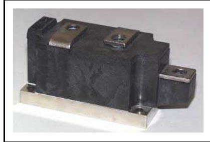
ND413425 Dual Diode Isolated POW-R-BLOK™ Module 250 Amperes / 2600 - 3400 Volts