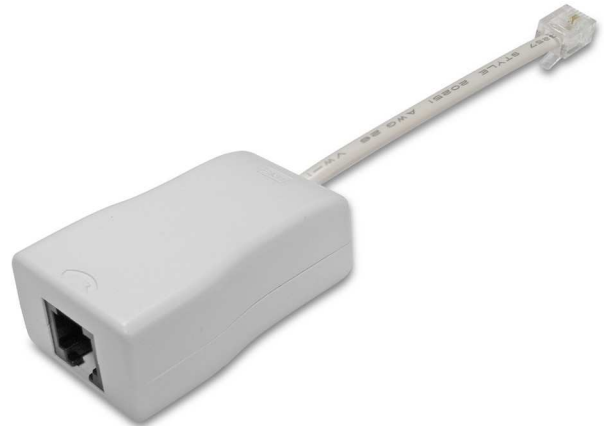
Z-330PJ xDSL over POTS CPE In-Line Filter

The Z-330PJ is a small, in-line, ANSI T1.421-compliant customer premises equipment (CPE) filter designed to expedite the service delivery and improve the performance of digital subscriber line (DSL) and home phoneline network (HPN) services over plain old telephone service (POTS). The Z-330PJ filters all telephones, facsimile (fax) machines, answering machines, and other telephone equipment. Its third-order filter design electronically isolates the high-speed DSL and HPN data streams from the voice-band POTS to provide premium voice quality and optimal DSL and HPN data rates.