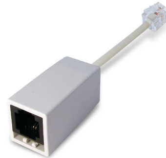
The in-line DSL nanoFILTER