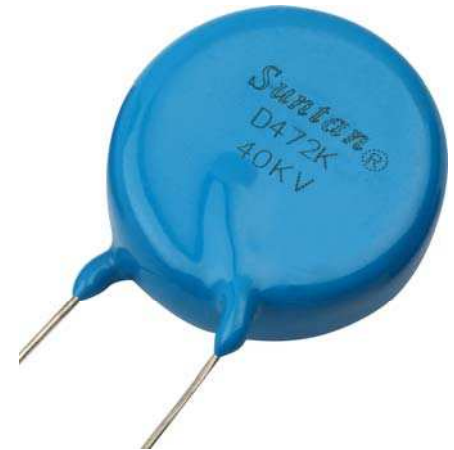
MINIATURE FINE SERIES