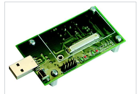
MIB520CB Mote Interface Board

Specifications subject to change without notice