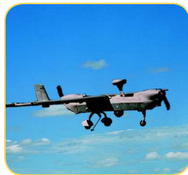
Unmanned Aerial Vehicle Control

The CRM Series remote magnetometers provide an RS-422 serial digital data bus with a Baud rate of 38,400. They are configured to operate in an auto send mode so that data is automatically and continuously transmitted following power up. Output data is transferred in a compact binary format that includes three-axis magnetic field data and built-in-test status.