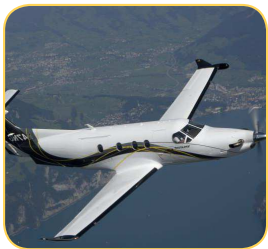
Primary Flight Display Heading Reference