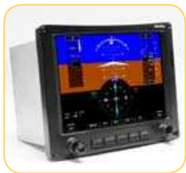
EFIS and Flight Management Systems