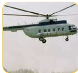
Airborne Antenna Control

The AHRS510CA meets all standard avionics performance requirements as a stand-alone system. For applications with more demanding performance requirements, the AHRS510CA provides the interfaces necessary to accept external velocity-aiding.