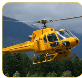
Flight Test Instrumentation

This standalone AHRS solution is designed for avionics retrofit and OEM aircraft applications. The AHRS500GA is available in several different configurations that provide the flexibility to accommodate various system interfaces, and typical mounting orientation and installation location requirements.