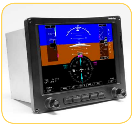
Primary Flight Display Systems