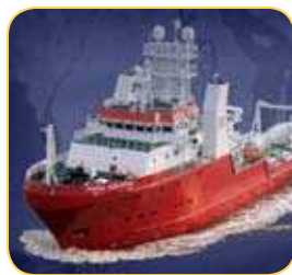
Sea State Monitoring

This rugged low-cost inertial system meets the demanding environmental requirements for operation in a wide variety of land vehicle and marine platform systems, and it is ideally suited for cost-sensitive high-volume OEM applications.