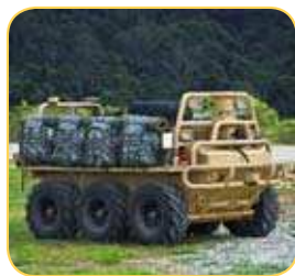
Land Vehicle Navigation

The IMU800CA is configured as a high performance IMU for integrated navigation systems. Output data is available in both analog and digital formats, and a VG700-compatible mode is available for customers converting from the FOG-based VG700 to the MEMS-based VG800.