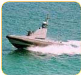
Unmanned Surface Vehicle