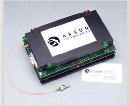
Axsun SSOCT Engine with DAQ Board

1. Dependent on Swept laser linearization and maximum K clock frequency.