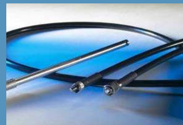
Liquid Transmission Probe