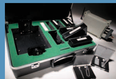
Gas/Liquid Accessory Kit

For more information Contact Axsun at: 1 Fortune Drive Billerica, MA 01821 Attn: Sales Department 978.262.0049 Visit us on the Web: www.axsun.com