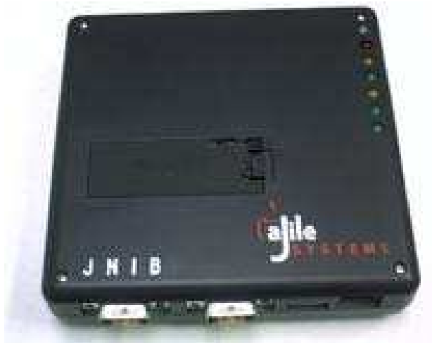
Figure 1: JNIB-102 Top Side

JNIB-102 system consists of 32B SDRAM, 32MB NAND flash, and a variety of standard interfaces for devices including 10/100 Ethernet port, dual serial ports (RS232), USB 2.0 host, SD slot, and 8-bit GPIO port. The 8-bit GPIO port is fully software programmable to configure discrete signals as either inputs or outputs.