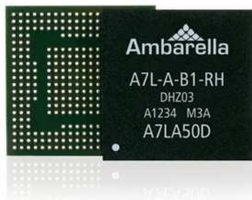
The A7L-A SoC is ideal for next generation automotive camera designs.

A7L-A enables WiFi connectivity for reviewing the captured video clips on iOS and Android devices. The SDK leverages Ambarella's multi-stream encoding capability which supports the recording of full HD video while simultaneously recording and streaming a second stream to the smartphone.