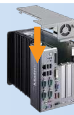
3. Replace it by plugging the hot-pluggable fan module cover into the fan connector on CPU board