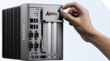
1. Undo the thumbscrew by hand