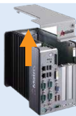
2. Withdraw the thumbscrew and remove the top cover