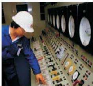
Connect up to 9 peripherals

The units can be daisy-chained for expansion. The versatility of the SuperSwitch makes it a practical investment for the budget-conscious.