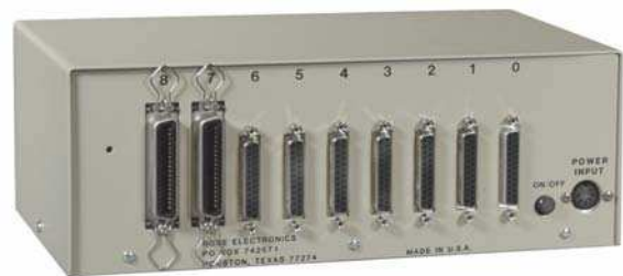
Rearview – model SS-9

** Each parallel port is programmable as a computer port or printer port