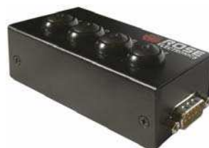
Instantly switch to a CPU port with the push of a button

Operations are made easy by using the push button features of the RCS system.