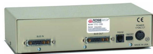
Rear view of ClassView model CVT

■ Phone: 281-933-7673 ■ E-mail: sales@rose.com ■