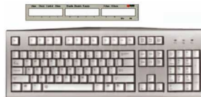
The ClassView keyboard template simplifies the teacher's access to the student's computers

Easy to install, easy to use, ClassView provides the modern way to teach in today's electronics classroom. Call us today to learn more on how ClassView can improve your training applications.