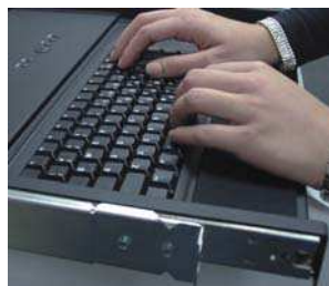
Access SUN servers directly from the rack

Sun computers can be directly accessed, monitored, and controlled locally using RackView.