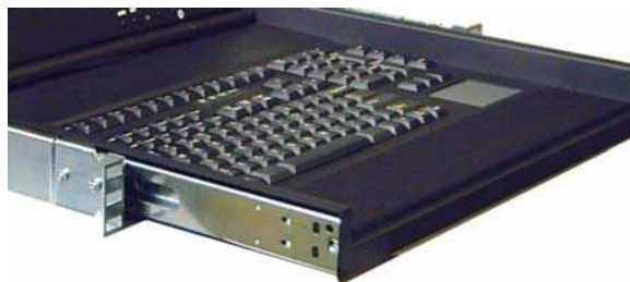
Full size SUN keyboard with integrated Touchpad

Environmental 32°F - 122°F (0°-50°C), 20%-80% non-condensing RH