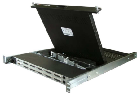
RackView with optional KVM switch

Environmental 32°F - 122°F (0° - 50° C), 20%-80% non-condensing RH