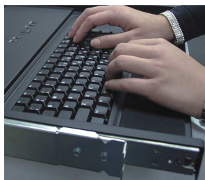
Easy access right at the rack

PC's, UNIX, Sun, and Apple computers can easily be accessed, monitored, and controlled locally using RackView.