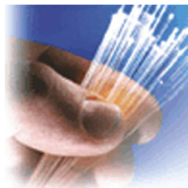
Fiber gives you greater distance, clarity, security, and noise immunity

Compatible with all Rose KVM products. CrystalView fiber offers a perfect solution for any application when you need a greater distance, a clearer picture, more reliability, or more security between computers or servers and workstations.