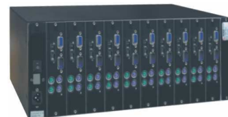
Rear view of CrystalView fiber chassis with 10 PC dual transmitters

■ Phone: 281-933-7673 ■ E-mail: sales@rose.com ■