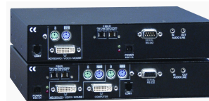
DUAL PC MODEL WITH AUDIO / SERIAL