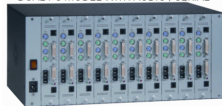
10 UNIT RACK

■ Phone: 281-933-7673 ■ E-mail: sales@rose.com ■