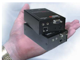
Small in size, loaded with features

The Serial/Audio model allows stereo audio to be transmitted in either direction across the CAT5 link simultaneously. Many serial devices like a Touchscreen can plug directly into the serial port on the Remote Unit. The Mini model is small in size but loaded with state of the art technology. It is ideal for extending the distance between a CPU and a KVM station (up to 150 feet).