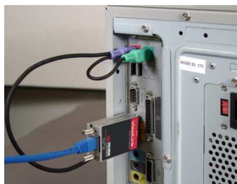
Connect the transmitter directly to a PC's Video, keyboard, and mouse ports