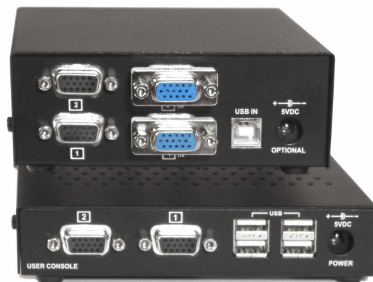
Rear view Local / Remote units Dual Video

■ Phone: 281-933-7673 ■ E-mail: sales@rose.com ■