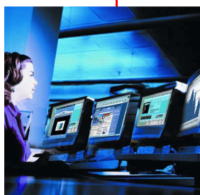
View single, or dual, video 1,000 feet away

The bi-directional serial option allows you to connect a touchscreen, digital tablet, serial printer or other supported serial device to the remote location. No set-up is needed; just connect the serial device to the serial port and it's ready to use.