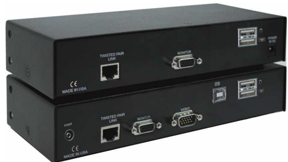
Rearview - CrystalView CAT5 USB KVM extender Remote (top) / Local (bottom)

■ Phone: 281-933-7673 ■ E-mail: sales@rose.com ■