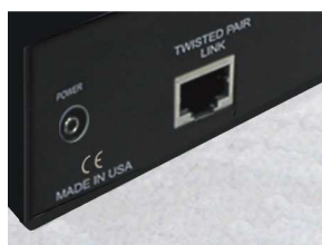
The link uses Standard CAT5 cable

Access to your computers is made convenient in a variety of situations. You can locate users away from hazardous industrial environments; locate CPUs away from areas vulnerable to theft of hardware and data; reduce noise and heat; increase desk and floor space. The dual access versions provide for a second KVM station at the local unit giving access to the CPU from either the local or remote unit.