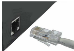
Standard CATx cable

The CrystalView DVI Mini extender supports a wide range of USB HID devices. All standard 2 button, 3 button, and wheel mice and all standard keyboards are supported. Other HID devices such as touch-screens, graphic tablets, barcode readers or similar HID devices may function properly but are not guaranteed. The CrystalView DVI Mini only supports a maximum of two USB HID devices.