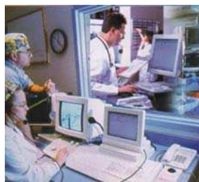
Medical or dental personnel access a computer from multiple locations

The MultiStation has a variety of other features to fine-tune your application. Call us to find out how the MultiStation can simplify your computer access.