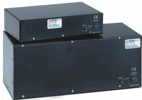
Rear view of MultiStation models ML-2U and ML-4U

■ Phone: 281-933-7673 ■ E-mail: sales@rose.com ■