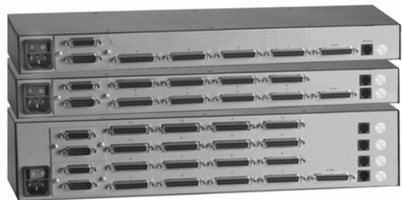
Rear view - UC1 1x4, 1x8, 1x16

■ Phone: 281-933-7673 ■ E-mail: sales@rose.com ■