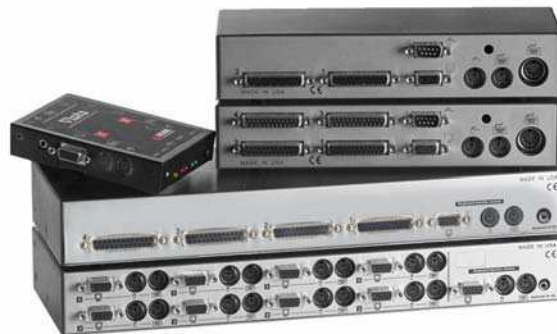
Rear view of Vista models KVL-8PCA, KVL4UA, KVT-2PC, KVM-4UPH, KVM-2UPH

■ Phone: 281-933-7673 ■ E-mail: sales@rose.com ■