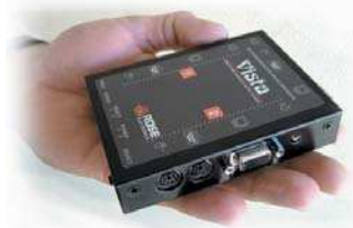
Vista-mini has Hi resolution video and stereo audio

Call us for more information on this excellent family of full-featured, easy-to-use, and economical KVM switches.