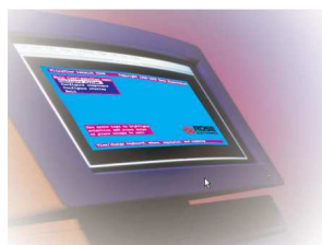
UltraView Pro on-screen menu

With its advanced on-screen menu system, built-in security, flash memory, easy expansion, front panel controls, and other features you start to get a sense of the UltraView Pro advantage.