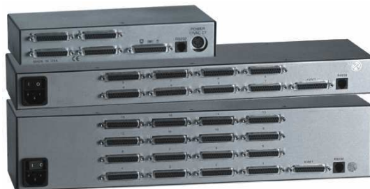
Rear view of UltraView Pro, 1x4 top, 1x8 middle, 1x16 bottom

■ Phone: 281-933-7673 ■ E-mail: sales@rose.com ■