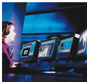
Independent or simultaneous switching of KVM and peripherals

The MultiVideo DVI can be connected to an additional unit and synchronized to switch video from multiple computers. When a switching command is sent to the master unit, it sends the same switching command to the secondary unit. Both units are switched to the same CPU port and video is displayed on all of the connected monitors.