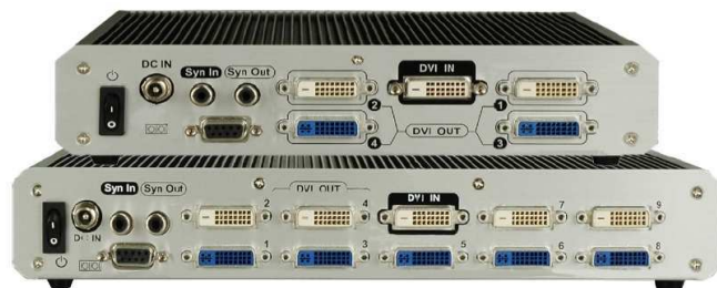
Top – VWL-B122D (2x2) Bottom – VWL-B133D (3x3)

■ Phone: 281-933-7673 ■ E-mail: sales@rose.com ■