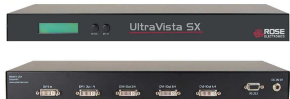
Front / Rear view

■ Phone: 281-933-7673 ■ E-mail: sales@rose.com ■