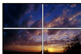
Display a video source across four displays

UltraVista SX maintains the original resolution quality of the input image on all monitors, producing a crisp, clear, perfect image.